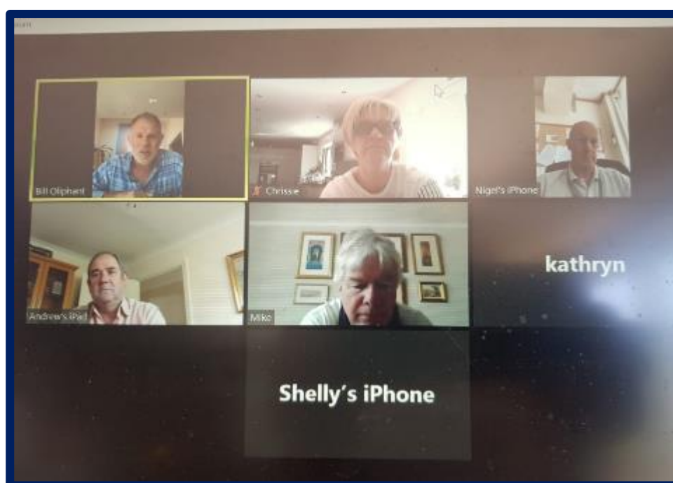
Central Office Staff holding their daily meeting using 'Zoom'.

PLEASE NOTE DURING THE CURRENT RESTRICTIONS CENTRAL OFFICE IS CLOSED. PLEASE USE EMAIL OR, IF THE MATTER IS URGENT, THE HELPLINE ON 07542 680082. STAFF HIGHLIGHTED IN RED ABOVE ARE CURRENTLY FURLOUGHED.