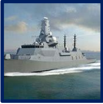
Type 26 Frigate