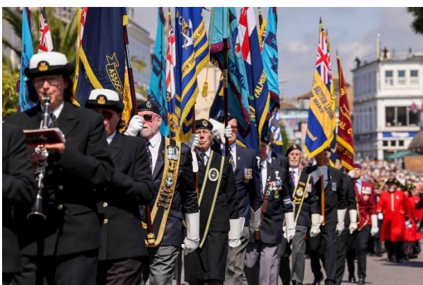
Armed Forces Day - Falmouth