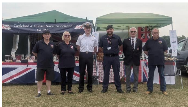
Castleford and District Branch