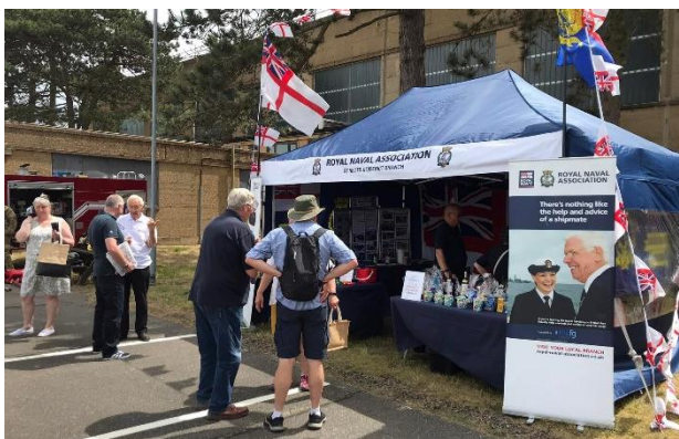
St Neots Branch